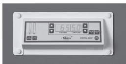
Flush Mount Unit

Chalet Gara Chemin de la Ferme, 7 3963 Crans-Montana Switzerland Tel: 41-27-481-6570 Fax: 41-27-481-8391 Email: Celiazermattenmatrx@bluewin.ch