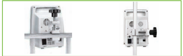
Bed Rail Clamp