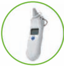
Infrared Ear Thermometer