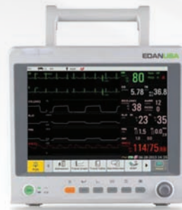
iM70 Patient Monitor