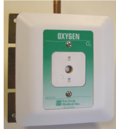
Outlet XQ1124 Shown

with the nameplate to the rough-in assembly, and provide automatic plaster adjustment from 1/2 to 1 1/4 of an inch (1.3 cm to 3 cm). The name of the gas service shall be permanently marked on the outlet bracket and the outlet. The outlet's rough-in supply tube shall be a 7 inch (18 cm) length of 1/2 O.D. copper Type K for all gas services and labeled with the name of the gas service.