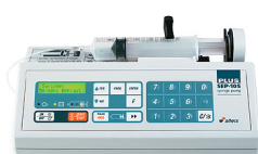
• SEP-10S PLUS