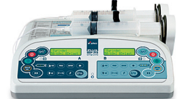
• SEP-21 PLUS

VILTECHMEDA Ltd. • 125 Kalvariju St., LT-08221 Vilnius, Lithuania Tel.: +3705 2776745, 2737508 • Fax: +3705 2763867 e-mail: faktor@aitecs.com • http://www.aitecs.com