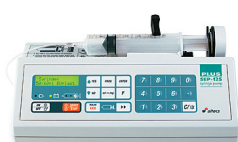
• SEP-12S PLUS