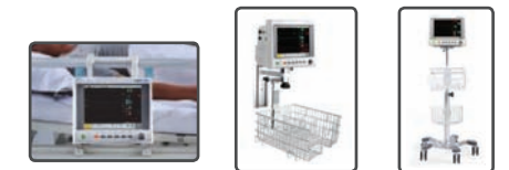
Bed Rail Hook