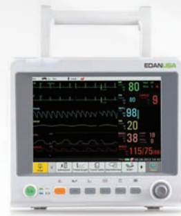
iM60 Patient Monitor